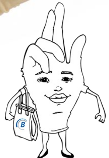
Ms. G. Love™ represents BioClean's range of cleanroom gloves