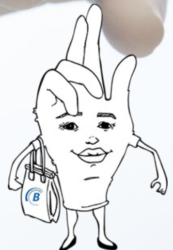
Ms. G. Love™ represents BioClean's range of cleanroom gloves