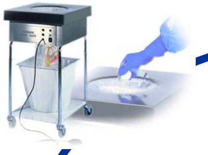
Disposal units for cytostatics