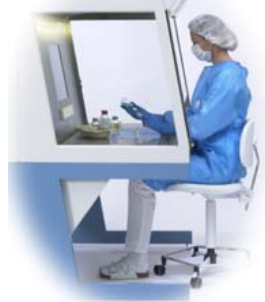
Cytostatic safety cabinets