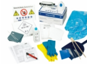
Single use items