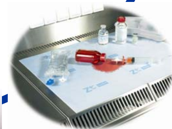
Cytostatic prep mats