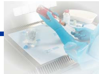
Protective safety gloves