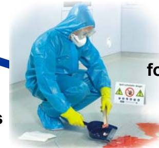
SpillKits for emergencies