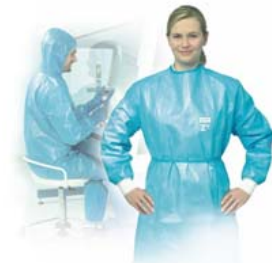
Personal Protective equipment