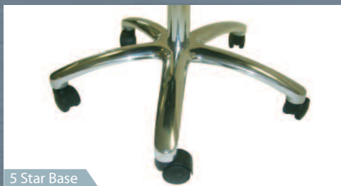
5 Star Base

The 500mm chrome plated foot ring, which is attached to the spindle, is fully height adjustable.